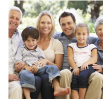
Multi-Generational Families of Means