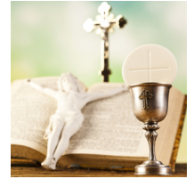
Catholic Foundations and Organizations